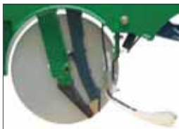
Planter Seed Tube