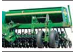
Pivoting Gauge Wheels