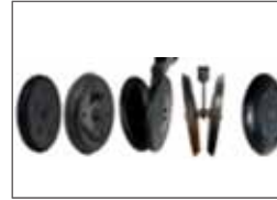
Press Wheel Choices