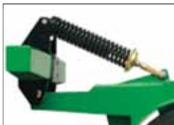
Heavy Duty Springs