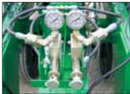
Active Hydraulic Down Pressure