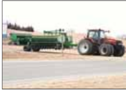
Narrow Transport Width