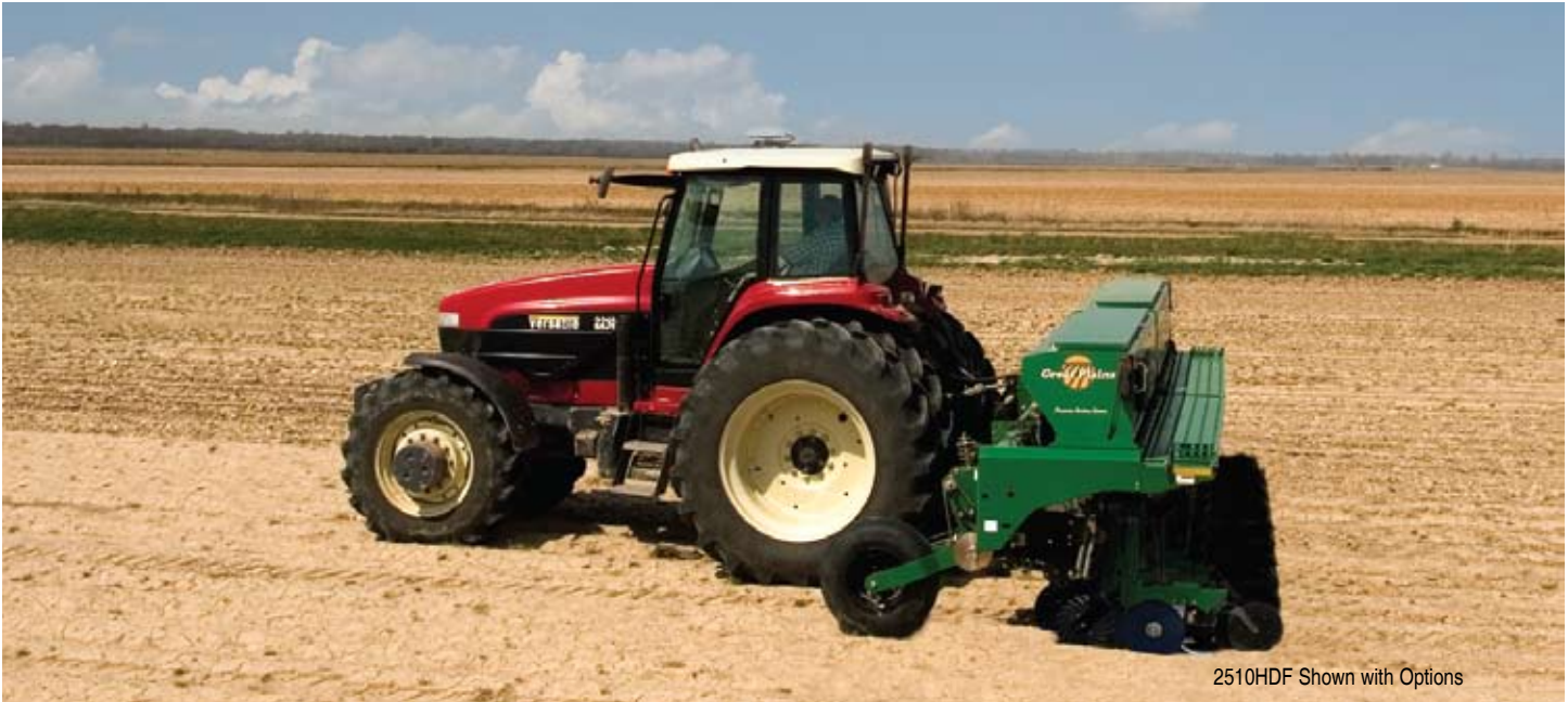
2510HDF Shown with Options