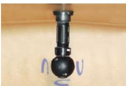
Flush and Rinse Turrets