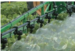
Wet Boom Plumbing