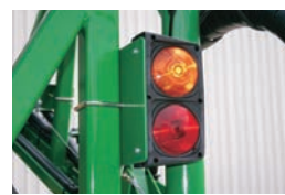
Safety Lighting Package