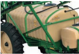
1230 Gallon Poly Tank