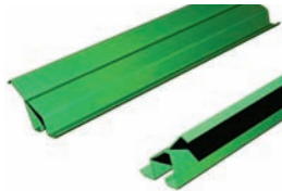
Heavy Duty Frame & Hitch