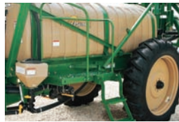
Walkboard & Ladder