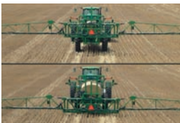
42" Cushioned Elevator