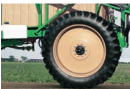
14.9 x 46 Radial Tires