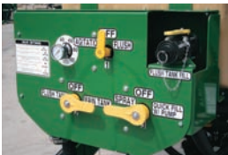
Central Control Panel