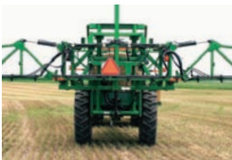
42" Cushioned Elevator