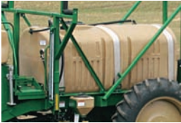
650 Gallon Poly Tank