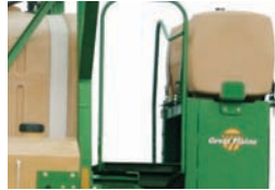
Walkboard & Ladder