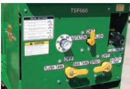
Central Control Panel