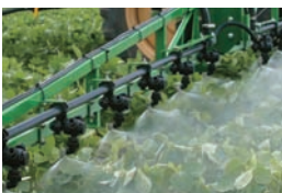
Wet Boom Plumbing