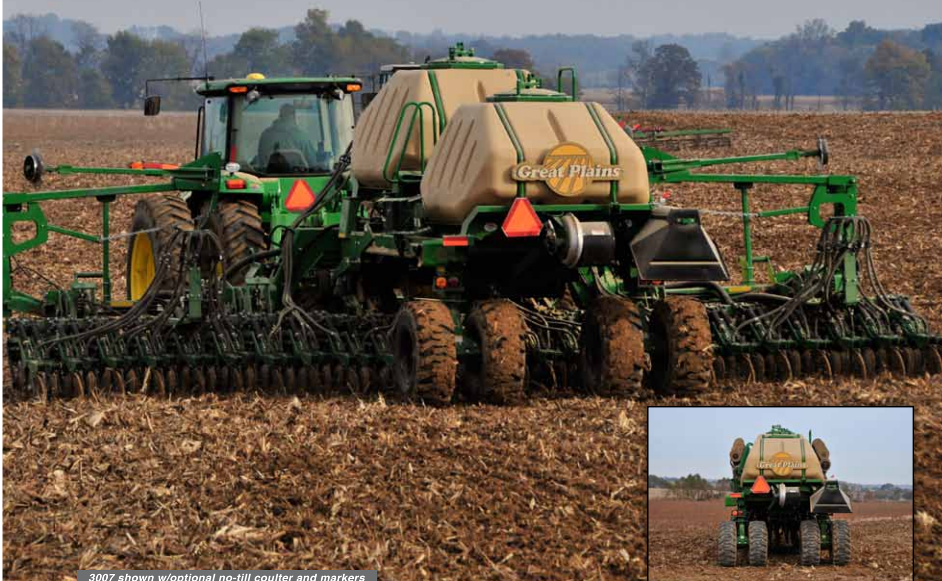
3007 shown w/optional no-till coulter and markers