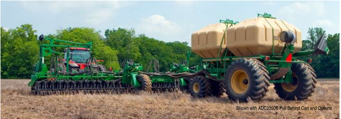
Shown with ADC2350B Pull Behind Cart and Options