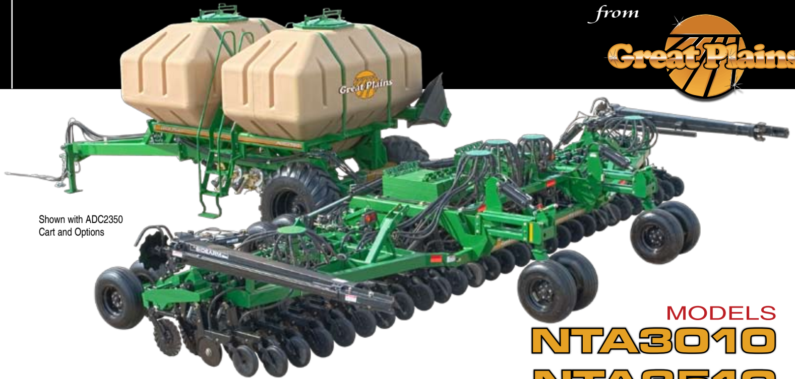
Shown with ADC2350 Cart and Options