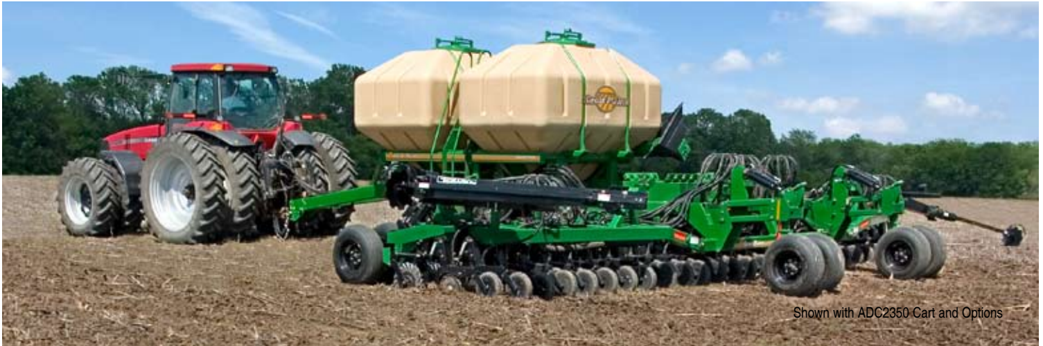
Shown with ADC2350 Cart and Options