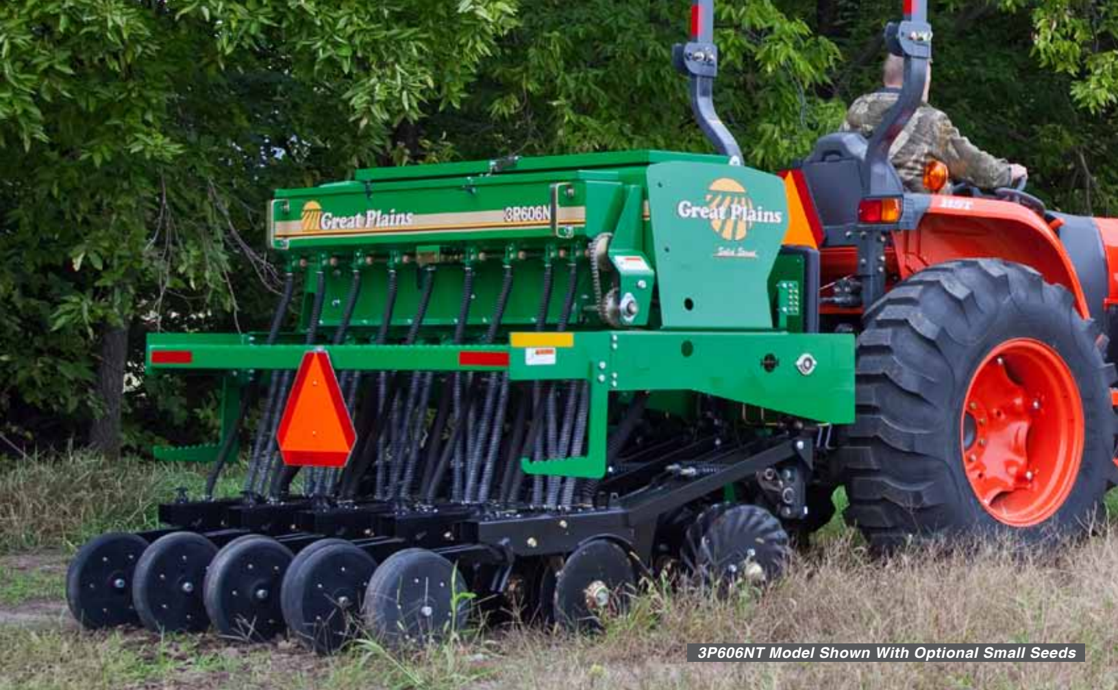
3P606NT Model Shown With Optional Small Seeds