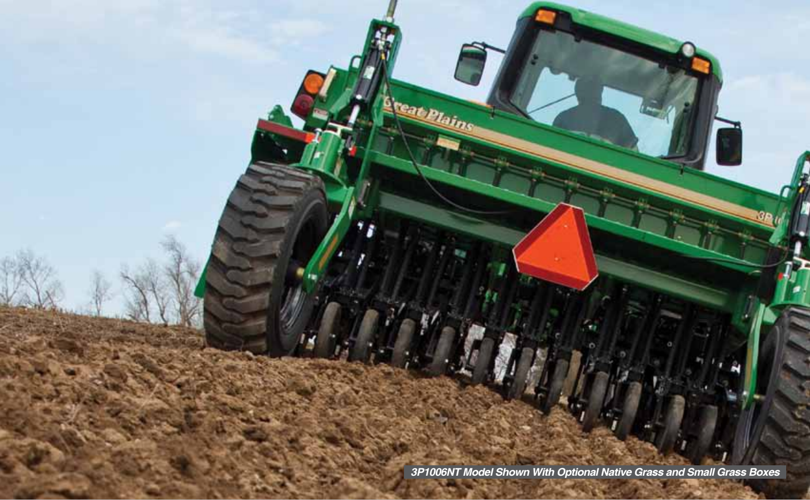
3P1006NT Model Shown With Optional Native Grass and Small Grass Boxes