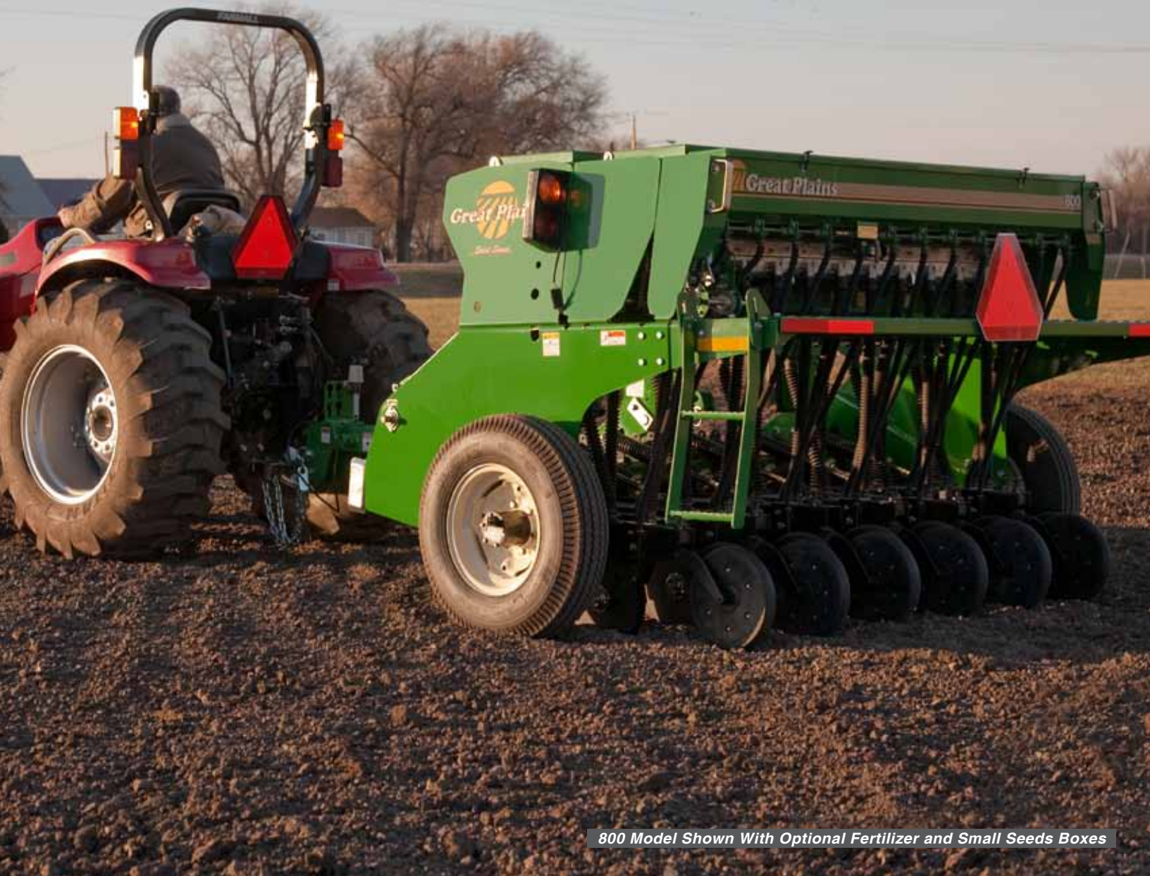
800 Model Shown With Optional Fertilizer and Small Seeds Boxes