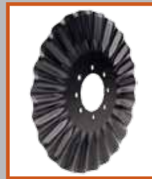
5/8" X 17" 24 Flutes