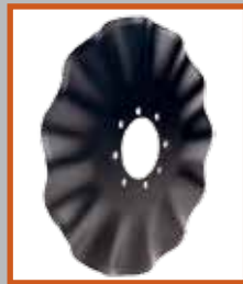
3/4" X 17" 12 Flutes