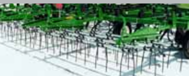
4 Row Coil Tine/3 Row Coil Tine & Reel