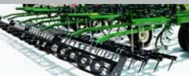
4 Row Spike & Reel