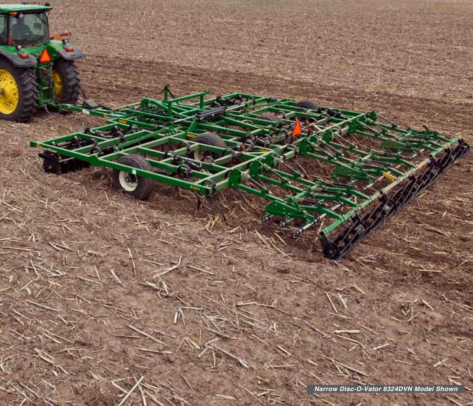
Narrow Disc-O-Vator 8324DVN Model Shown