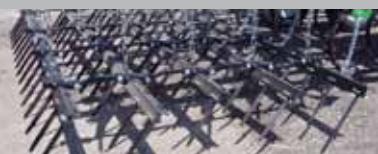
Hi Residue 5 Row Spike/7 Row Spike