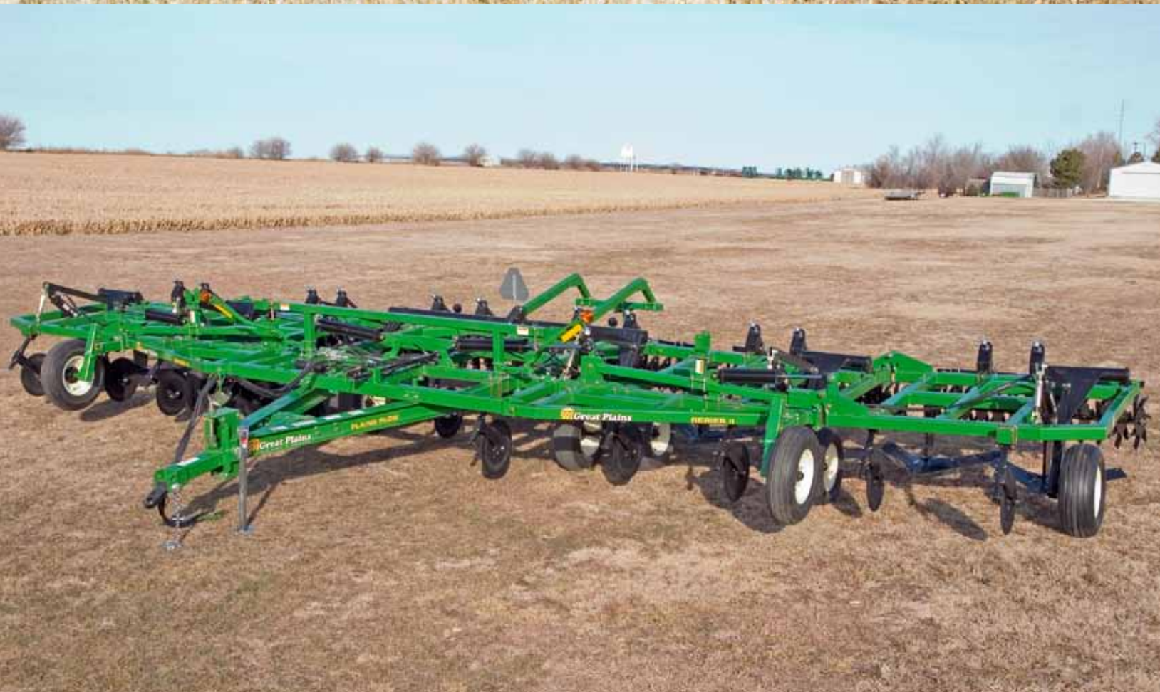
Plains Plow 9533PP Model Shown