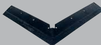
6 1/2" HIGH PITCH BLADES - The optional 6 1/2" blade offers additional lifting of the soil for greater weed kill along with more wearing surface to increase the life of the blade as well.