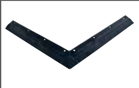
48" SWEEPS - Narrower than standard V Blades to provide more consistent depth in rolling conditions.