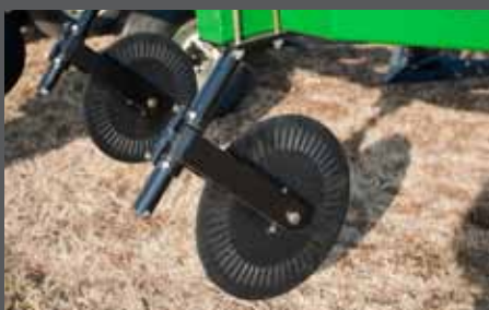
HEAVY DUTY ROLLING COULTER - The Rolling Coulters are a full 20" blade with a yoke mounted 4-bolt hub assembly.