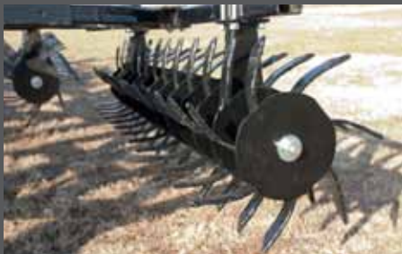
21" TREADER WHEEL - On 7" spacing is ideal for breaking clods, uprooting weeds and preparing a seedbed. Hard faced for long life.