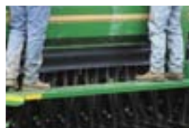
Walkboard and Ladder