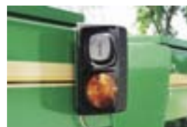
Safety Lighting Package