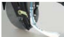
Keeton or Seed-Lok® Seed Firmers