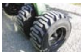
Skid Steer Tires