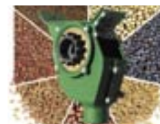
1 3/4" wide Fluted Feed Cup