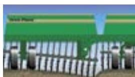
Independent Opener Travel