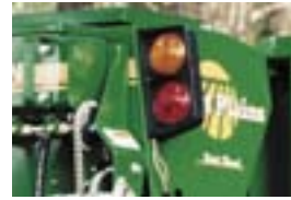
Safety Lighting Package