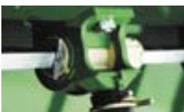
Small Seeds Box