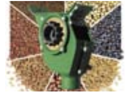
Fluted Feed Cup