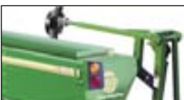
Flat Fold Markers