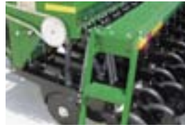
Walkboard and Ladder