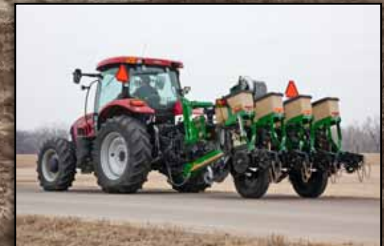
YP-425A model shown with optional markers and Twin-Row configurations