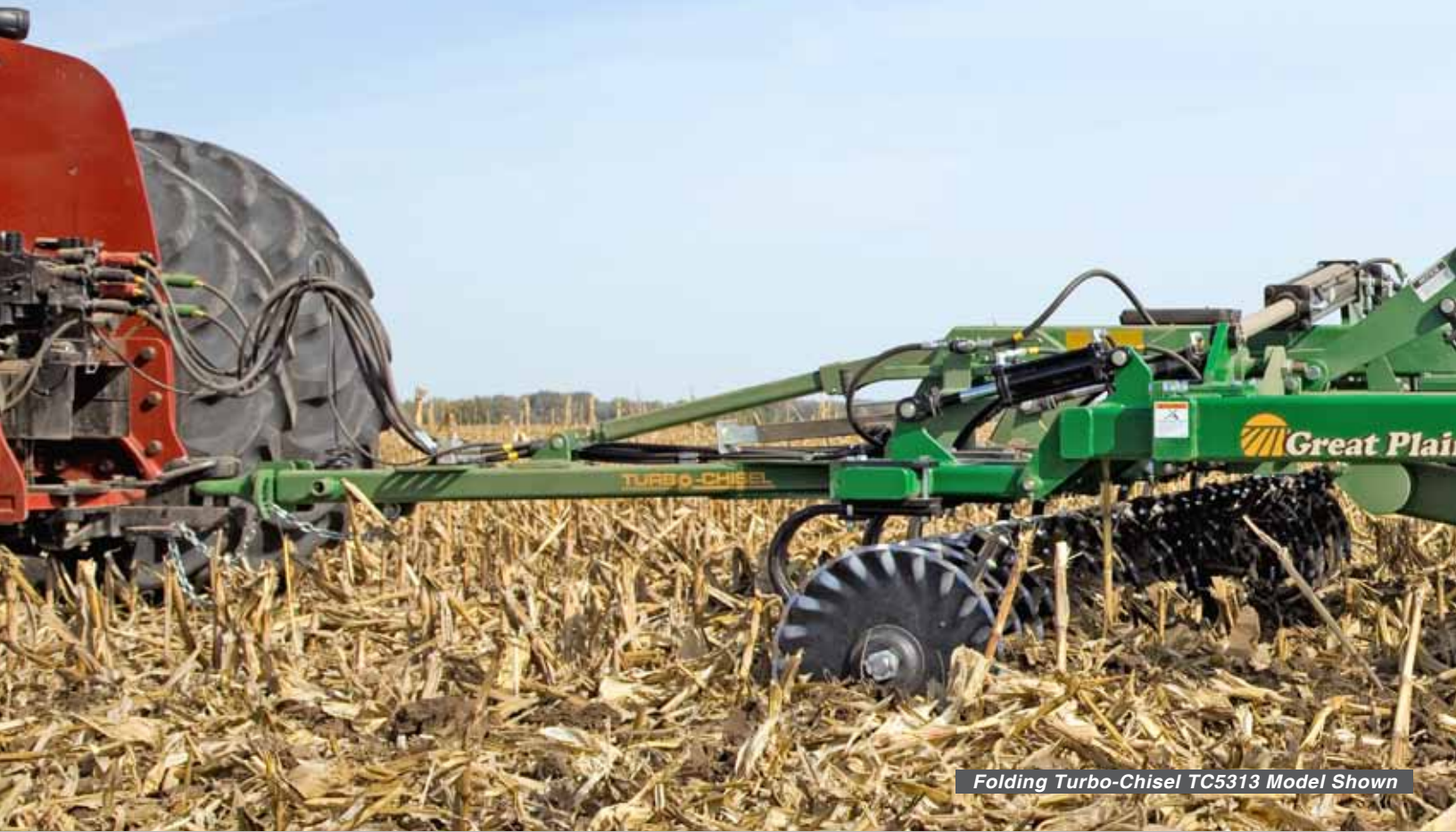
Folding Turbo-Chisel TC5313 Model Shown