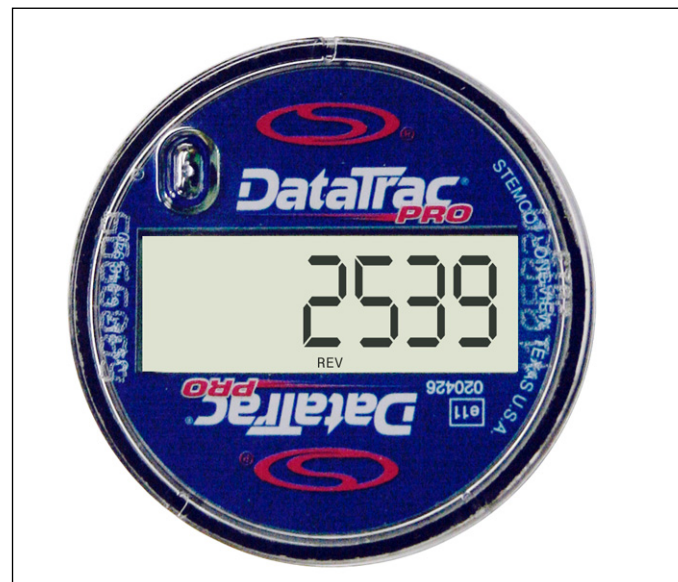
Figure 3 Typical Area Display