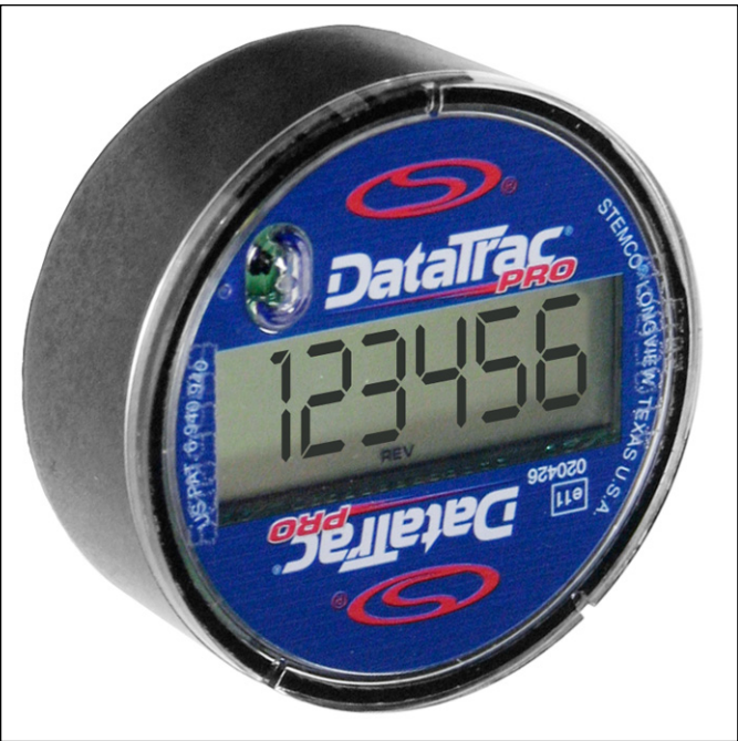
Figure 1 DataTrac Electronic Acre Meter